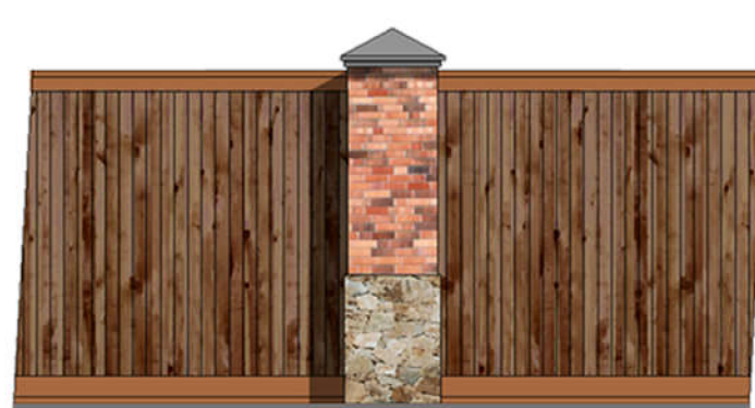
RESIDENTIAL STREET BUFFER- SCREENING N.T.S.

8" BOARD ON BOARD STAINED WOOD FENCE W/ 9" STONE/ BRICK COLUMNS @ +/- 80' SPACING.