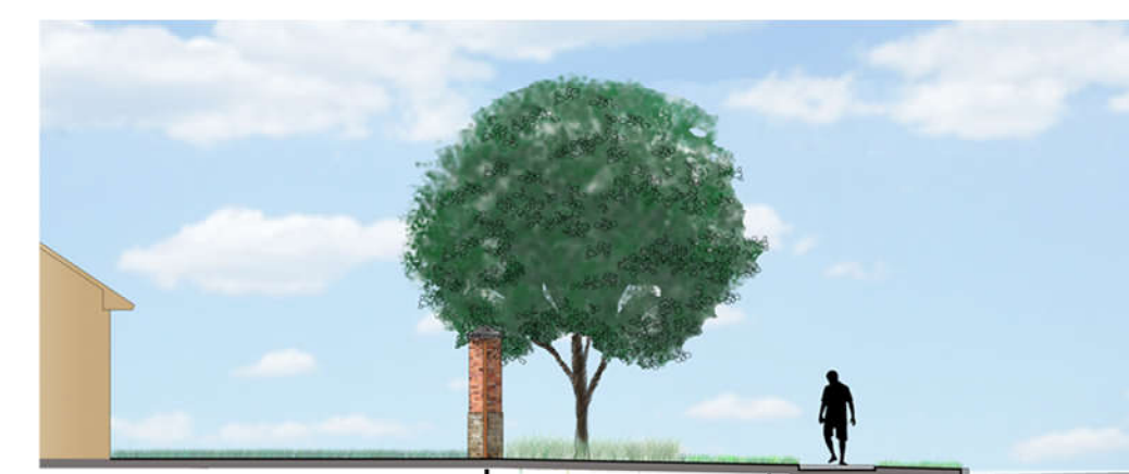
RESIDENTIAL STREET BUFFER- SECTION